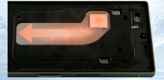
*For performance details, please refer to https://sg.sharp/products/mobile/

By adding a vapor chamber to the conventional thermo management system, further heat dissipation is achieved